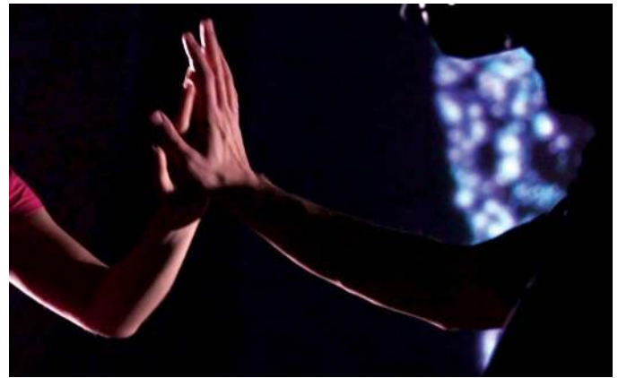
Fig. 4. Physically touching their hands together allows participants to connect their virtual auras and move between the installation's three modes.