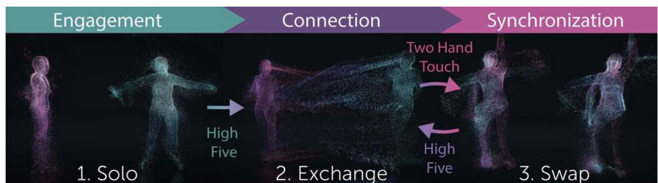
Fig. 3. Progression of interaction through Body RemiXer . (© John Desnoyers-Stewart, 2020)

Becoming more immersed. We designed Body RemiXer to allow immersants to interact with or without the headset to make the installation more accessible to all participants. Those who put on the headset find themselves surrounded by the virtual space seen in the mirror projections. Their body and the bodies of those around them are transformed into auras of energetic particles, each with their own color. The identities of friends, strangers and oneself become blurred together as they are abstracted.