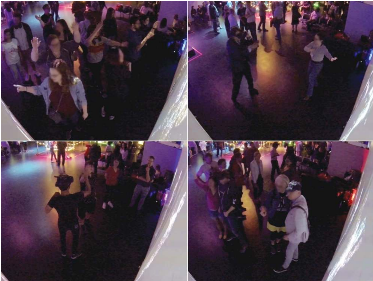
Fig. 7. Examples of interactions seen in our observations. Clockwise from top left: several participants interact together; two immersants dance together, one in VR; immersants hold each other as they interact; a headset-wearer high-fives another immersant.

Connecting by touching hands seemed to prompt immersants to playfully explore larger possibilities of tactile interaction: We observed people hugging, trying to touch their legs together, reaching out to touch a stranger's head or inviting someone to waltz. For headset-wearers, the neutral appearance of the virtual bodies around them appeared to reduce their social inhibition. Subsequently, the interaction between a headset-wearer and others around them seemed to occur across the social norms of two distinct spaces, as indicated by observations of touch that would not have ordinarily occurred between strangers. In most cases, the headset-wearer initiated contact and the other reciprocated, becoming more active as they become more familiar with VR and their ability to navigate the space around them. These unusual forms of social contact may have enabled interpersonal embodied interactions and formed what Bourriaud calls a social interstice, where connections emerge in ways not otherwise possible outside of the installation.