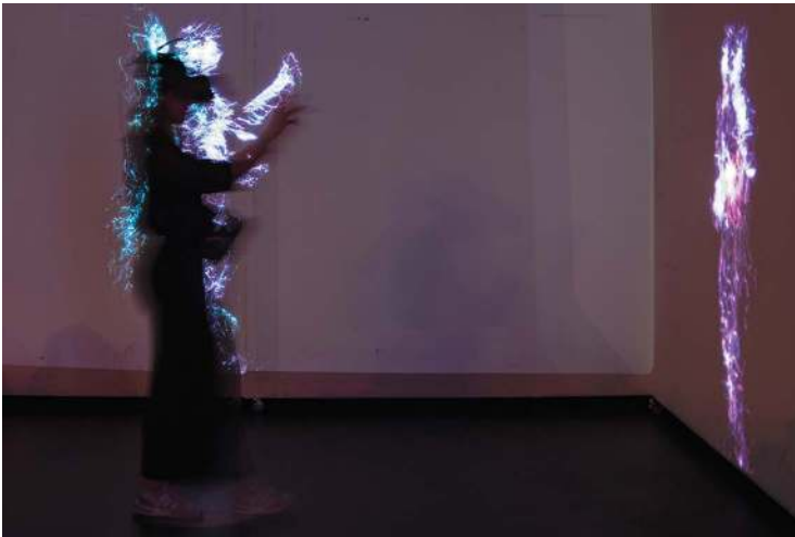
Fig. 6. Immersant reaching toward their reflection in VR.

This momentary alteration has the potential to persist beyond the installation, both in those relations established through the experience and in the newly realized social potentials of the immersant. As an MR installation, Body RemiXer is designed to allow for connection to evolve across the virtual/actual divide, connecting the experiences within these realms together. Immersants are encouraged to adopt their virtual auras through MR mirrors (Fig. 6). From here, interpersonal connection starts as physical touch between immersants and extends into the virtual merger of their auras. This could then extend back to the connection between the actual participants leaving the exhibit and beyond into their subsequent relations.