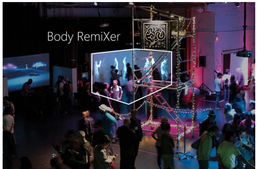
Fig. 5. Body RemiXer as shown at A Carnival of Mixed Realities .