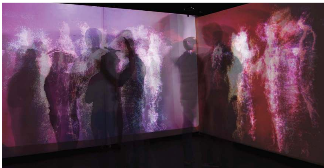
Fig. 1. Composite image of several people interacting with Body RemiXer . (Composite by John Desnoyers-Stewart. Original photos © Andreas Psaltis, 2019.)

As immersants enter the installation, they are tracked by a Kinect, which transforms their bodies into clouds of particles on the projection screens forming three-dimensional silhouettes that follow their movements. Body RemiXer invites immersants to engage in expressive movements and tactile interactions with one another that are made socially acceptable through the context of the installation. By touching hands with other participants, immersants connect their virtual auras through a steady exchange of particles, blurring the boundaries between them. This newly established connection manifests as a drumbeat that gets louder when they move together.