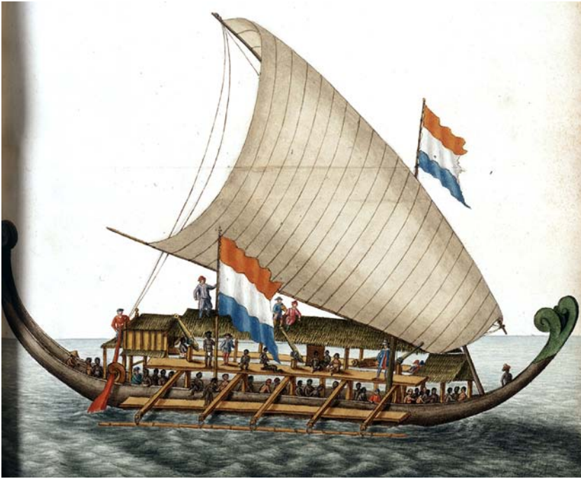
FIGURE 3. Moluccan kora-kora with mounted artillery under Dutch flags. From the Blaeu–Van der Hem Atlas, 1665–1668. Austrian National Library.

kora-kora located off the coast of Celebes, fighting under Makassar's authority, or in any case on its behalf and against the Dutch, during the Great Ambon War of the 1650s. Note that the kora-kora portrayed here have sails pushed up by a tilting boom—a peculiarly Austronesian feature. Figure 3 shows a kora-kora from around the same time, possibly a bit later, with deck-mounted artillery, under Dutch flags. 48 This image usefully illustrates both shared boat design with the Pacific as well as the ongoing impressment of Southeast Asian seafarers to serve in hongi under the VOC. Although the infamous hongi raids were conducted in an effort to maintain Dutch control over the clove harvest, after 1656