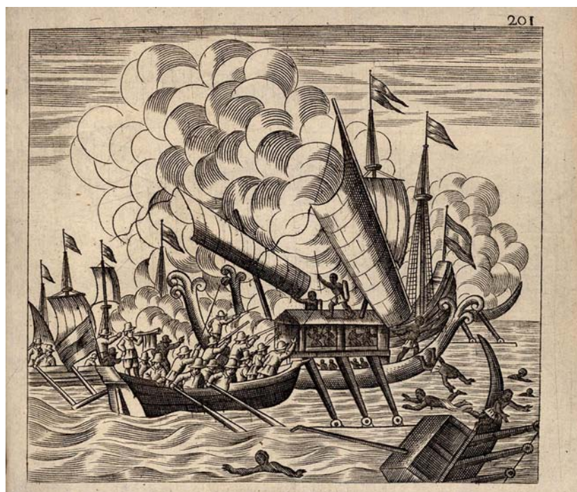
FIGURE 2. Naval battle off the coast of Celebes between the Dutch and forces under Macassar during the Great Ambon War (1651–1656). From Livinus Bor, Amboinse oorlogen door Arnold de Vlaming van Oudshoorn als superintendent, over d'oosterse gewesten oorlogachtig ten eind gebracht , 1663. National Library of the Netherlands.

in rough weather or fighting on the open sea, yet their shallow draft made them very effective in coastal areas and amphibious actions. 46