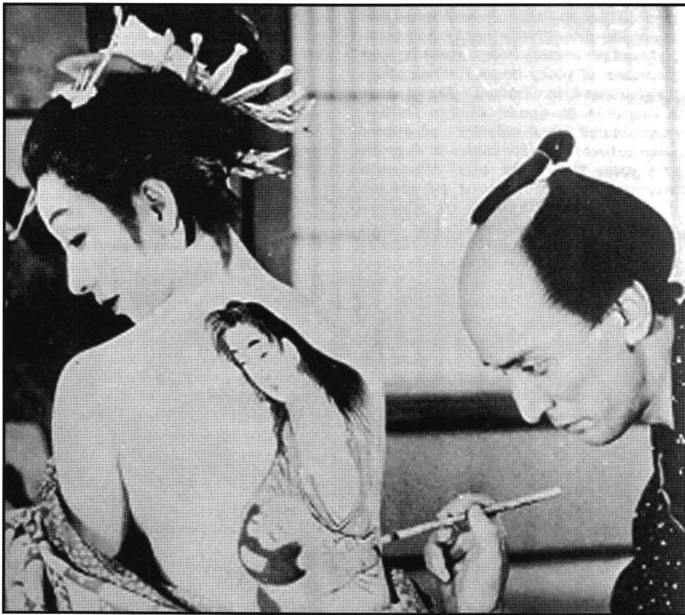
Mizoguchi's Protagonist: Problems of Art, Life, Values.