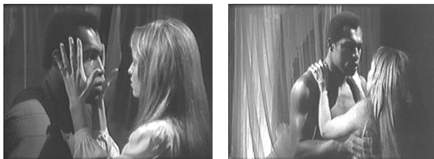
Fig. 4. The Mistress and Mandingo. Video frame enlargement.

sexual pleasure possible within relations of domination? In Scenes of Subjection , Saidiya Hartman emphasizes the problem of agency exemplified in assigning will to a subject who has no rights in the context of slavery. She argues that the “simulation of will disallows redress and resistance when slave subjugation is “determinate negation.” 16 But does not the lack of any will for the slaves reinscribe them into an unquestioned status of beasts of burden? Certainly, the crucial question is how to do the impossible measurement of agency without (1) obscuring the terror of slavery or (2) fulfilling Hartman’s diagnosis of a “spurious attempt to incorporate the slave into the ethereal realm of the normative subject through consent and autonomy.” 17 Consent, will, and choice are indeed questionable concepts in the context of slavery as racial domination. Yet sex acts in the film show both slaves and masters as subjects-in-struggle within circuits of power.