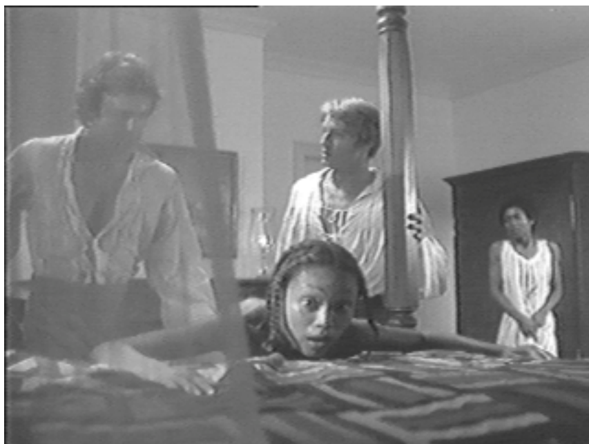
Fig. 2. The young wench beaten by her master. Video frame enlargement.

her body is sanctioned for rape, a very young wench demonstrates that she understands her lot. Her master hands her off, gives her like a pillow to Hammond's cousin, who happily claims his entitlement to violate her. Despite her seeming passivity to the ritual sexual assault, the scene is shot to prioritize the violence of the experience. Her eyes widen to the agony of his spanking. No matter how accustomed she may be, the pain continues to be shocking. While she may seem to accept her slavery, her facial expressions and bodily convulsions show the forcible violence and demeaning subjugation meant in these acts. The master demands her complicity in order to secure his pleasure in the need for her to say she likes it. Within this moment, she defends herself by making any semblance of her self and her experience unavailable to him. He shoves her to the bed, turns her over on her stomach, undoes his belt and whips her fiercely for her refusal. By assaulting her body, he forces her into a conscious acknowledgment of his mastery. She registers total contradiction through bodily, and not so much verbal, speech. The shot shows the drama of the wench's rape: a close-up of her pain in the foreground, and looming behind